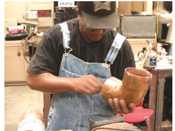
RAC student performs procedures according to proper specifications.