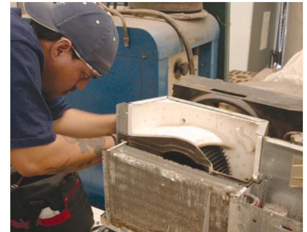
RAC student inspects and tests cooling components.